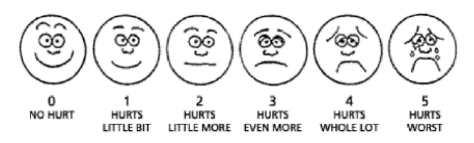
Figure 2: Wong-Baker Faces scale